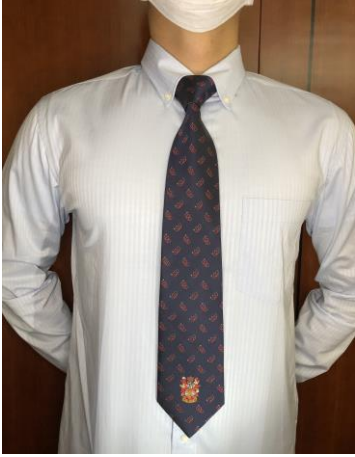
HKMA 100th Anniversary Tie (Blue) HK$ 150