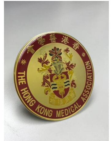
HKMA Car Badges HK$ 100