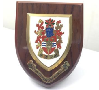
HKMA Wall Plaque HK$ 240