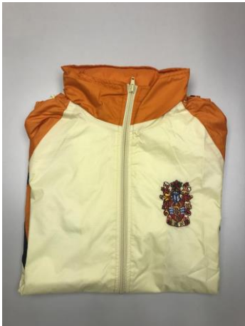
HKMA Windbreaker HK$ 200