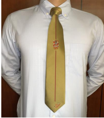
HKMA 100th Anniversary Tie (Gold) HK$ 150