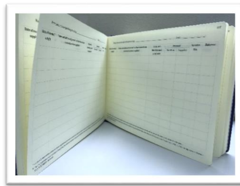
Inner page (196pp)